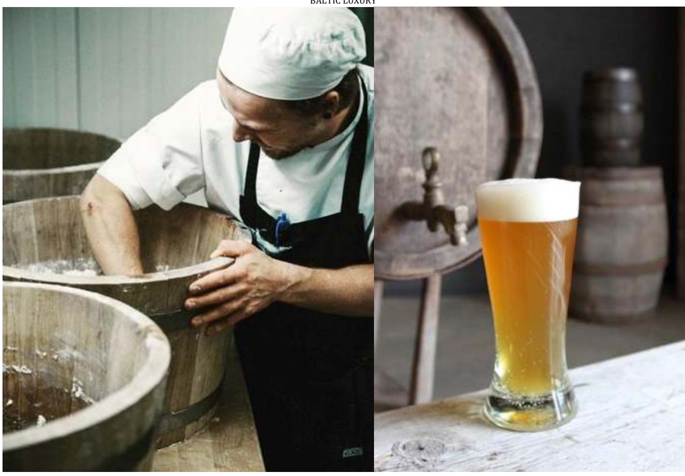
Lunch (for additional cost, place will be advised later)

After lunch transfer back to your hotel Transfer by luxury class vehicles with soft drinks offered in the car (Mercedes Benz V).