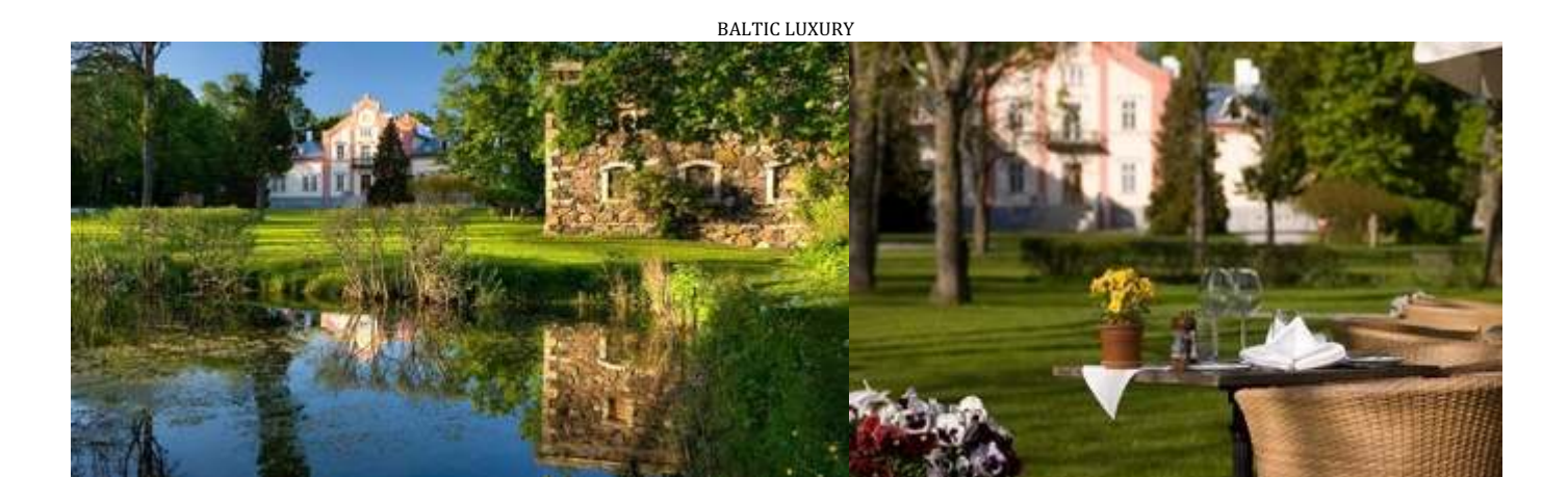
Arrival to Pädaste Manor 5* Small Luxury Hotel & SPA (SLH) at Muhu Island for 2 nights.

The origins of the manor go back to the 14th century & some of these ancient walls are now at the very heart of the house. The Manor House is the latest building of the Pädaste Estate that has been entirely renovated. The owner's goal was to create one of the finest hotels in the Baltic countryside, which they have perfectly gained.