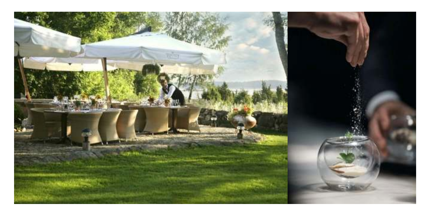
Day 5 Breakfast at your hotel

Dinner at Pädaste Restaurant (for additional cost)