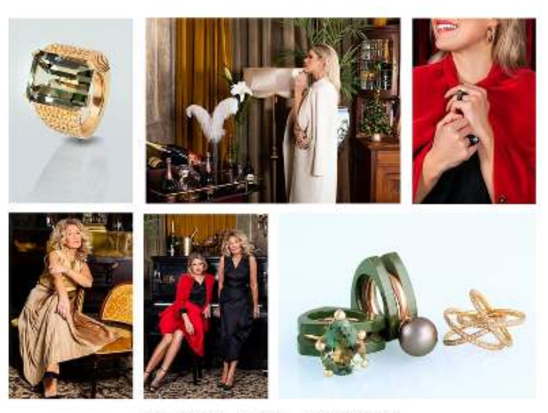
Fine jewellery - Clothing - Luxury handbags