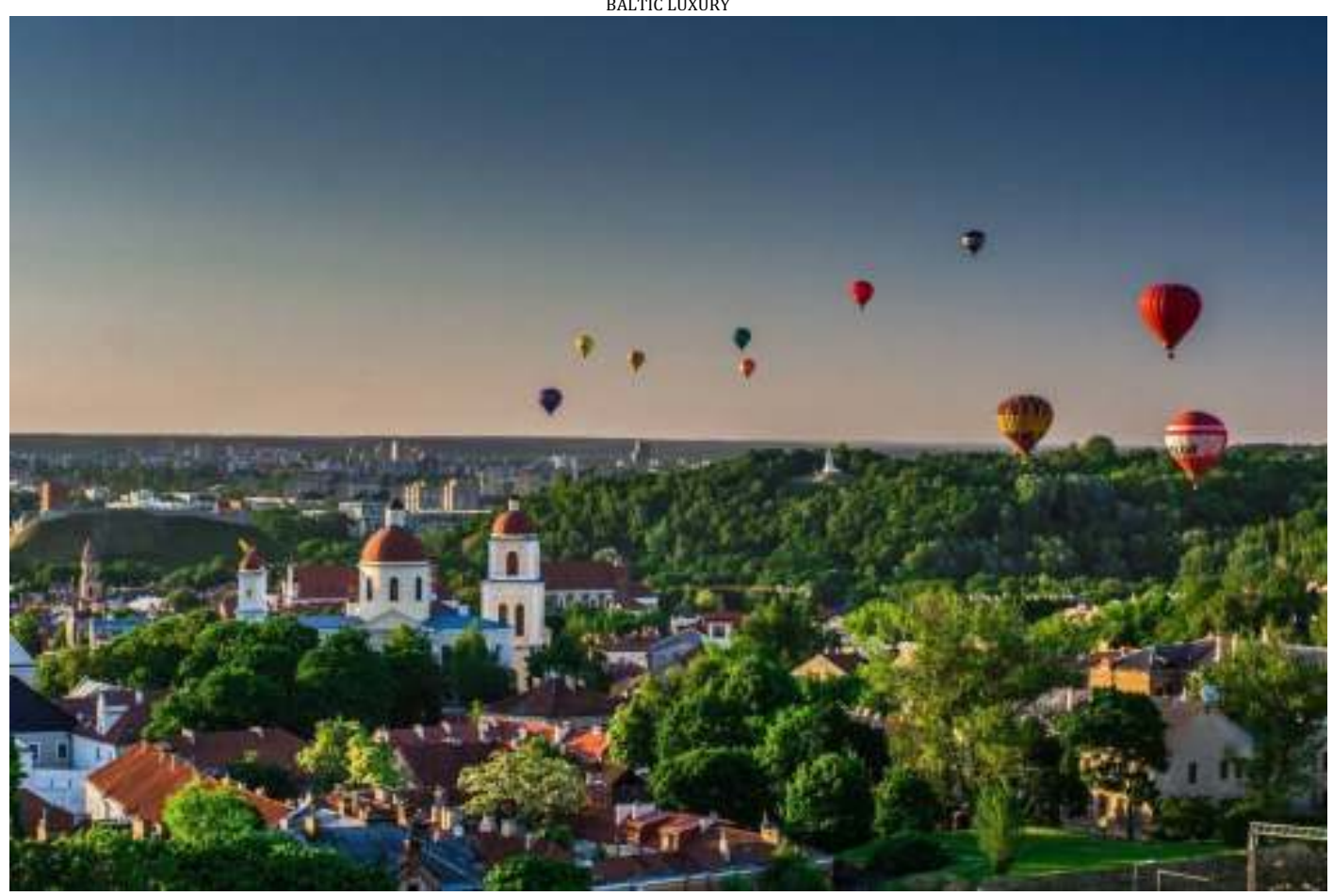
Arrival to Vilnius