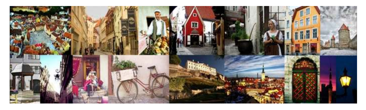
ESTONIA – Where Medieval meets Modern

Despite decades after the fall of the "Iron Curtain", the Baltic countries of Estonia, Latvia & Lithuania remain a mystery to most travellers. It's still advantage for those, who are looking for special, undiscovered places, new experiences and life enriching. Fascinating cities, unique accommodation, exclusive gastronomy, original visits as well as authentic meetings with the locals will change your favourite destinations list!