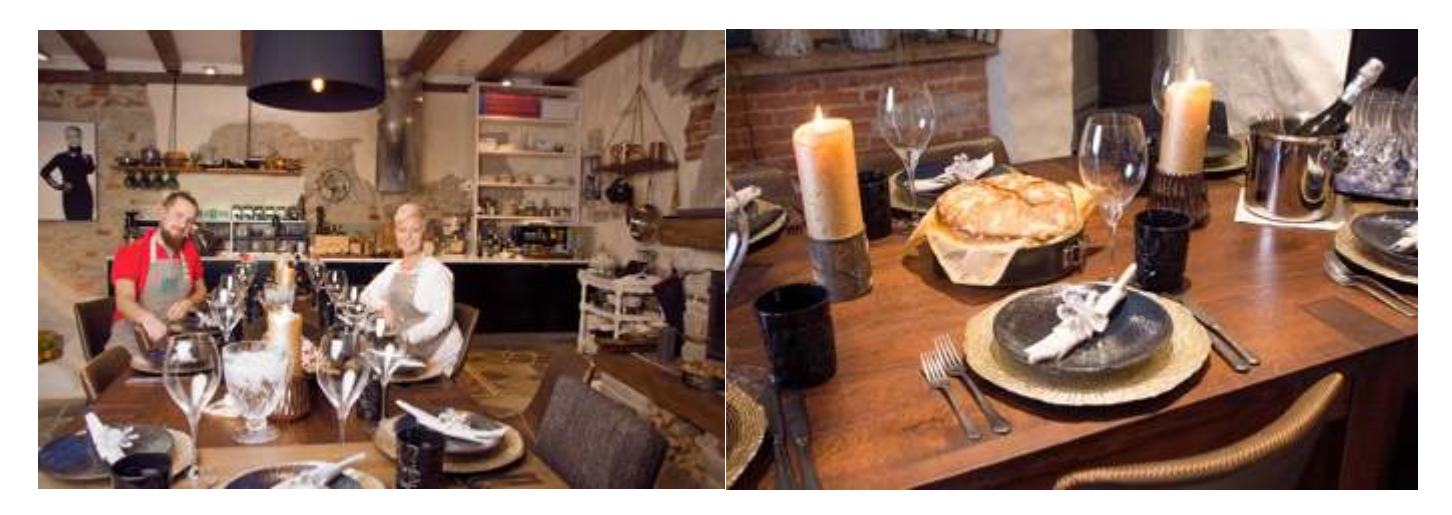
Day 2 Breakfast at your hotel

Dining in this homestyle restaurant will feel like an evening with friends – friends who can cook very well! Hostess Evelin Ilves, former First Lady of Estonia welcome guests into a 700-year-old house in the Old Town for a food experience. Dishes are based on local, seasonal ingredients with a highlight on Estonian coastal cuisine. Meals can be customized to dietary requests and are available by pre-booking only.