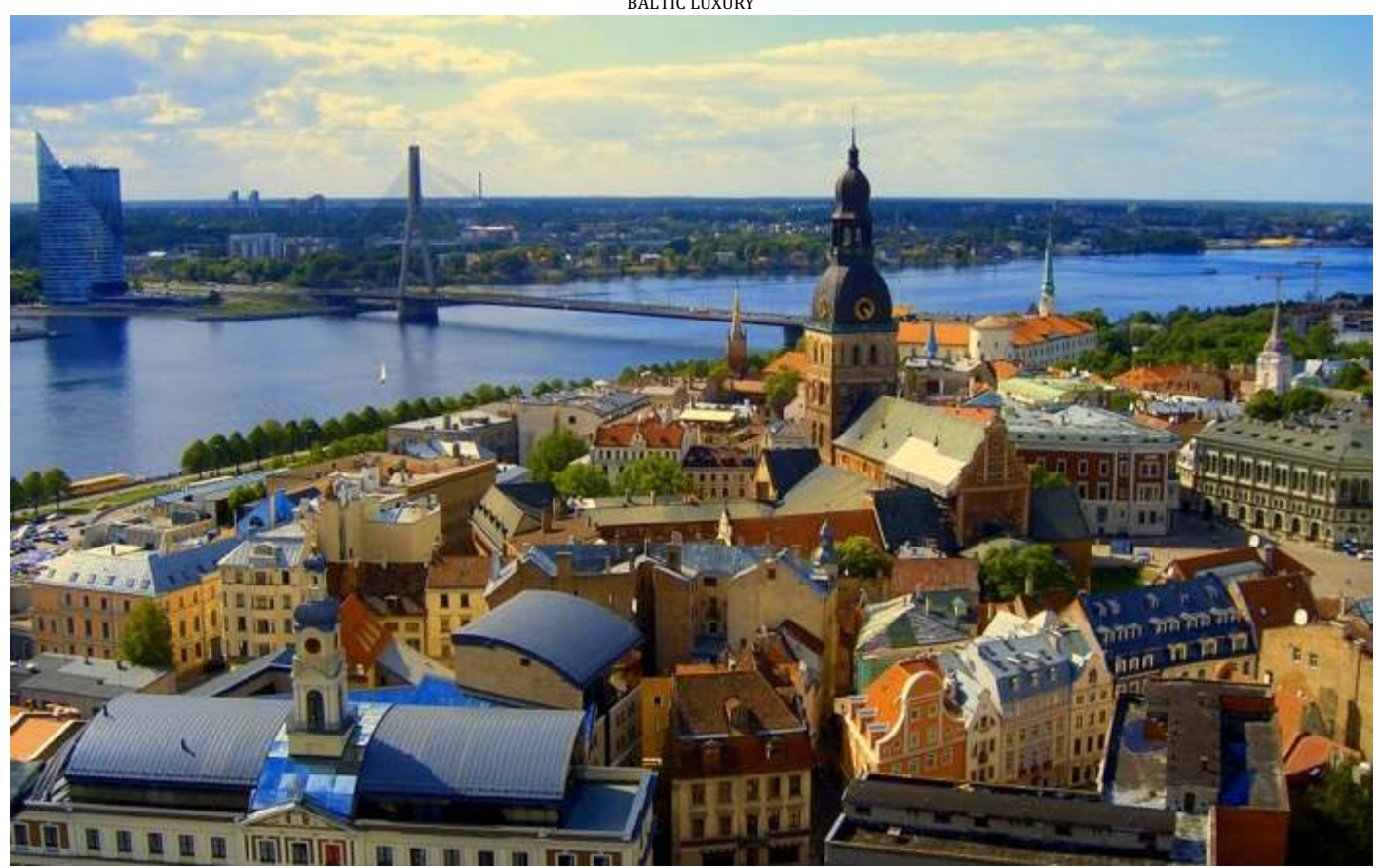
LATVIA - The European Region of Gastronomy 2017

Latvia's gastronomy may have been influenced by Germans, Swedes, Poles and Russians, but if we look at national celebrations, then we see one very unique aspect of the past that is still with us – Latvians like to be in contact with nature and to produce and prepare food with their own hands. Every family knows where to get fresh fish. During the autumn, Latvians forage for mushrooms, and during the spring and summer, they often grow their own vegetables, as opposed to buying them at a shop. Because of this cultural and gastronomic heritage, the Rīga and Gauja region have won the title of the European Region of Gastronomy 2017, the concept being "Wild at Palate." The presence of great restaurants in the region helped to nab the title, too.