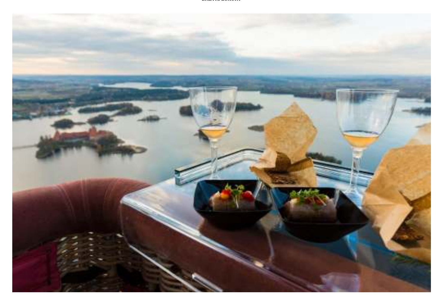
Transfer back to hotel

Transfer by luxury class vehicles with soft drinks offered in the car (Mercedes-Benz V)